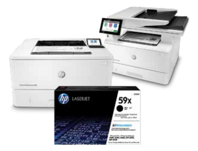
Original HP 59X/76X High Yield Black LaserJet Toner Cartridge (~10,000 pages)<sup>26</sup>

Original HP Toner cartridges help protect against counterfeits. Anti-fraud technology authenticates that a genuine Original HP cartridge is installed and allows you to enable fleet-wide printing policies that support Original HP-only cartridges. HP design, production, and supply chain processes help keep your printing system secure,<sup>25</sup> and tamper-resistant chips help ensure customers get the Original HP quality they paid for.<sup>24</sup>